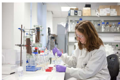
Sediment column set up in the environmental radioactivity lab